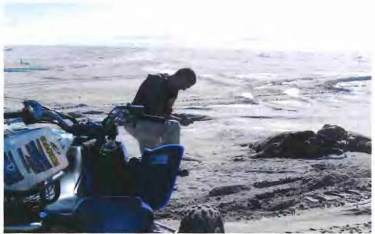
A NOAA special agent in the Northwest Division conducts an investigation under the Marine Mammal Protection Act. The lethal, intentional, and/or egregious take of any marine mammal is a high priority for Northwest Division.