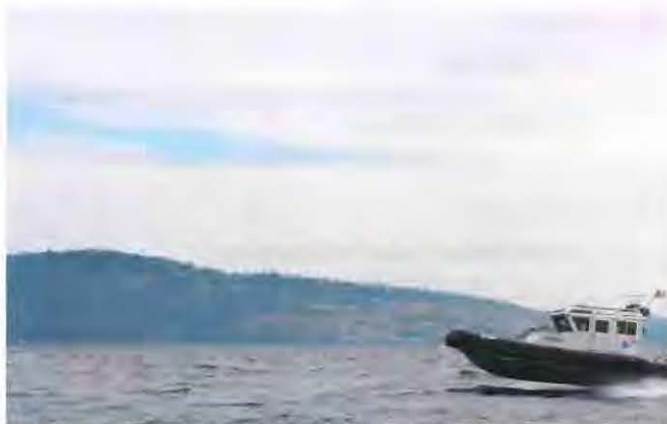
NOAA's Office of Law Enforcement's jurisdiction spans more than 3 million square miles of open ocean, more than 85,000 miles of U.S. coastline, and all of the country's National Marine Sanctuaries and Marine National Monuments. NOAA's Office of Law Enforcement also is responsible for enforcing U.S. treaties and international law governing the high seas and international trade.