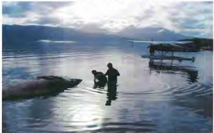
NOAA special agents conduct an investigation under the Marine Mammal Protection Act.