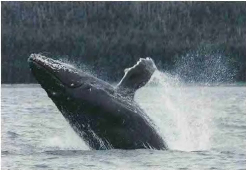
A humpback whale breaches in Alaska. Lethal takes and Level "A" harassment with the potential to injure marine mammals such as whales is a high priority in Alaska Division, as is any violation involving injury or potential injury to people, such as a vessel-whale collision.

We identified our enforcement priorities through a consultative process both within NOAA and with external stakeholders, starting with NOAA's National Enforcement Summit in August 2010. After the summit, NOAA's Office of Law Enforcement and NOAA Office of General Counsel's Enforcement Section reached out to fishery management councils, interstate commissions and others to solicit more input, which helped them establish NOAA's Draft Enforcement Priorities. The draft document was published for 60 days of public comment, during which NOAA's Office of Law Enforcement held seven calls with the public to outline the priorities, answer questions and receive feedback. The suggestions received during the public comment period helped our national directors and Special Agents in Charge hone the priorities into this final document. The priority setting process, including ample opportunities for public input, will be undertaken annually.