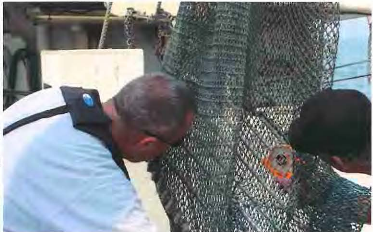
A NOAA special agent and a state partner check the angle of a Turtle Excluder Device. TEDs education and enforcement are a high priority for NOAA's Office of Law Enforcement's Southeast Division.