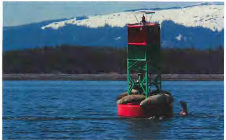
Steller sea lions sun themselves on a buoy in Alaska. Lethal takes and Level "A" harassment with the potential to injure marine mammals such as the Steller sea lion is a high priority for Alaska Division.